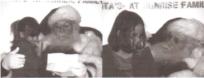
Santa Clause came to the SFR Christmas party on December 17 to listen to youth's final Christmas wishes and gave boxes of gifts to each of the children who attended.

From the staff of Sunrise Family Resort!